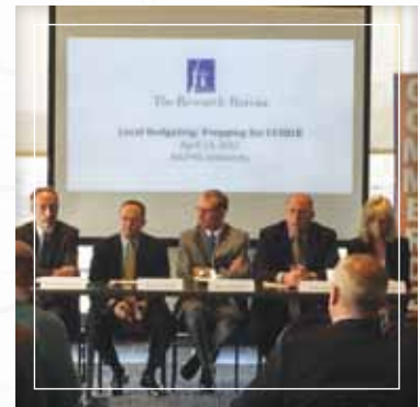
Local Budgeting: Preparing for FY2018