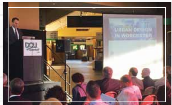
Growth by Design II: Designing the Future of Worcester