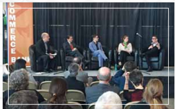
Growth by Design: The Interplay Between Urban Development & Urban Design