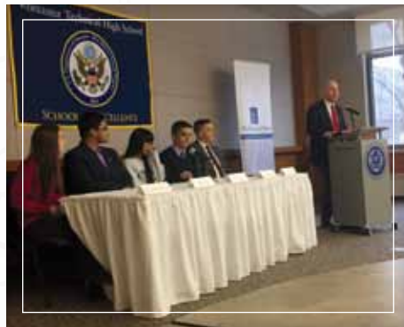
Valedictory: Achieving Excellence in Worcester Public Schools