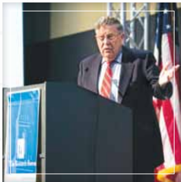
31st Annual Meeting featuring Governor John H. Sununu